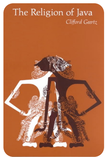
Fig 2. Geertz's The Religion of Java

the Indonesian armed forces.<sup>17</sup> This absence of the political dimension of religion is the more remarkable because during Geertz's fieldwork in Java in 1953-1954 manifestations of political Islam formed part of daily life, and Geertz did not only notice those, but also recorded them in his book The Religion of Java .