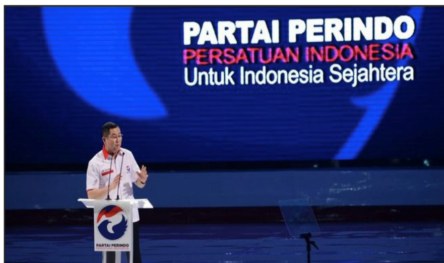
Figure 4. Hary Tanoe declared the Partai Perindo

Hary Tanoe represents the ‘faces’ of Chinese Indonesians who show concern over society’s challenges and offers solutions through business savvy and political power. He now represents Chinese Indonesians who are free to participate in any arena, which was previously restricted to people of mixed race. Hary Tanoe show that Chinese Indonesians can have political and business influence. Although his motivations in joining politics were not received positively by some, including stories of him using his business influence in politics, Hary Tanoe breaks stereotypes and offers the possibility that the Chinese Indonesians can greatly participate in an ever-changing society. 24