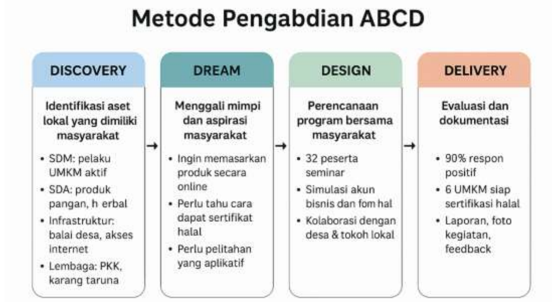
Figure 1. ABCD Service Method Diagram

This structured and evidence-based implementation demonstrates that the ABCD approach was not merely normative but functioned as a practical tool to mobilize community assets for sustainable empowerment. The findings support recent studies highlighting that ABCD achieves greater sustainability when combined with measurable outcomes and community-led monitoring mechanisms (Chen et al., 2024b; Shé, 2020).