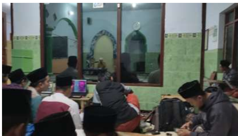
Figure 7. situation of the participants of the religious study on the terrace of the prayer room

The people who attend the Muqoddimah Hadramiyah study session are men and women over the age of 30. As Asep Fathur Rozi said, the state of society in Indonesia right now is such that parents will definitely look for other ways to learn more about their (Rozi & Nabilah, 2023). Elderly individuals can acquire education through both formal and informal means. The Majelis Ta'lim exemplifies a resilient non-formal educational institution that persists in modern society. The participants of the Muqoddimah Hadramiyah study sessions at Musholla Al-Amin believe that they have acquired a significant amount of knowledge and have identified solutions to personal challenges, particularly those related to worship. They maintain that their comprehension has substantially enhanced as a result of their attendance at these sessions. They have acquired a wealth of knowledge that was previously unknown to them, particularly in relation to the practice of worship. Before their departure, they were unaware of the resources available to them for obtaining information regarding Islamic law, such as the permissible and impermissible activities.