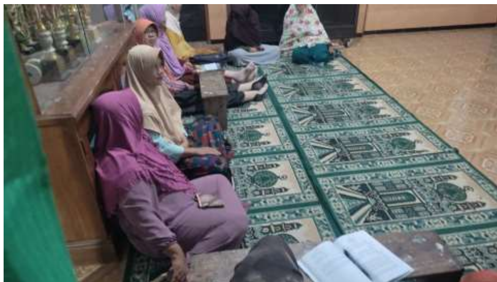
Figure 9. Participants of the Majelis Ta'lim activities among the mothers

through religious study groups (ta'lim) or religious study groups, which are not limited by location or time. Majelis Ta'lim is a form of non-formal educational institution that can be attended by groups of women aged 30 to 40. As long as they have a desire to study the Koran, there are no restrictions on their participation in these Majelis Ta'lim activities (Misnawati, 2021).