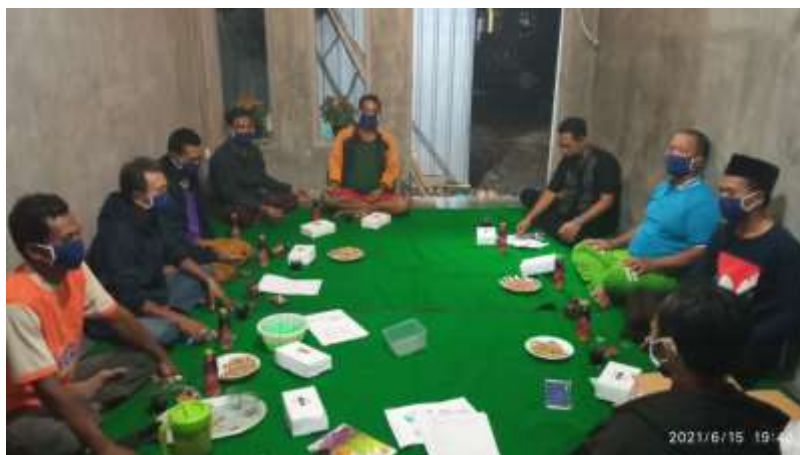
Figure 2. A meeting between residents and the mosque committee at the house of the leader of RT.