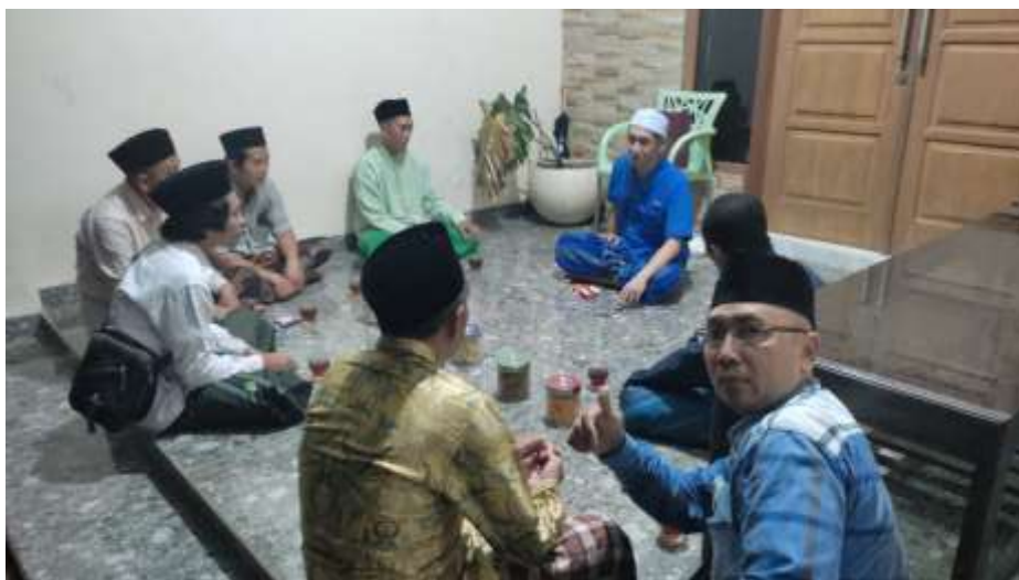
Figure 3. The volunteer group, along with community leaders, mosque administrators, and residents, went to Ustadzs' house.