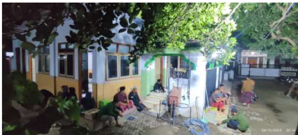
Figure 8. The condition of the congregation from among the fathers

The study activities for the Muqoddimah Hadramiyah book at Musholla Al-Amin have been executed exceptionally well and can be regarded as highly structured, despite the fact that this is not a formal Islamic educational institution. Additionally, the material is derived from the Qur'an and hadith, as well as classical Islamic texts, and is presented through a question-and-answer and lecture format. The role of the Islamic study group in society is to strengthen the foundation of human life in the mental and spiritual fields of Islamic religion in order to improve the quality of life integrally, both physically and spiritually, worldly and hereafter simultaneously, in accordance with Islamic teachings, namely faith and piety which encompass life in the world and all areas of its activities (Febri Widiandari, 2022). Freire emphasized the importance of education that empowers communities to understand and transform their social realities. In the context of religious study groups, the mentoring method implemented allows communities not only to passively receive information but also to actively participate in discussions and critical reflection on the religious material presented. This is evident in the increased community involvement in question-and-answer sessions and discussions during the study groups, demonstrating that they not only understand the material but are also able to apply it in their daily lives (Suparman, 2021).