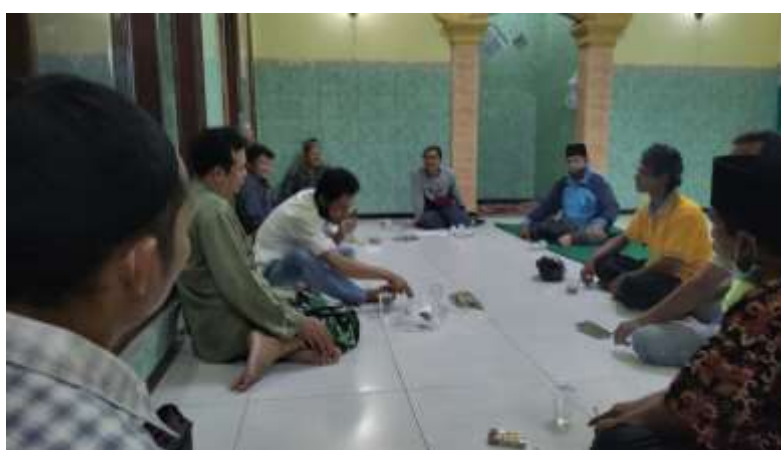
Figure 5. The service team is drafting the program plan in collaboration with the appropriate parties.