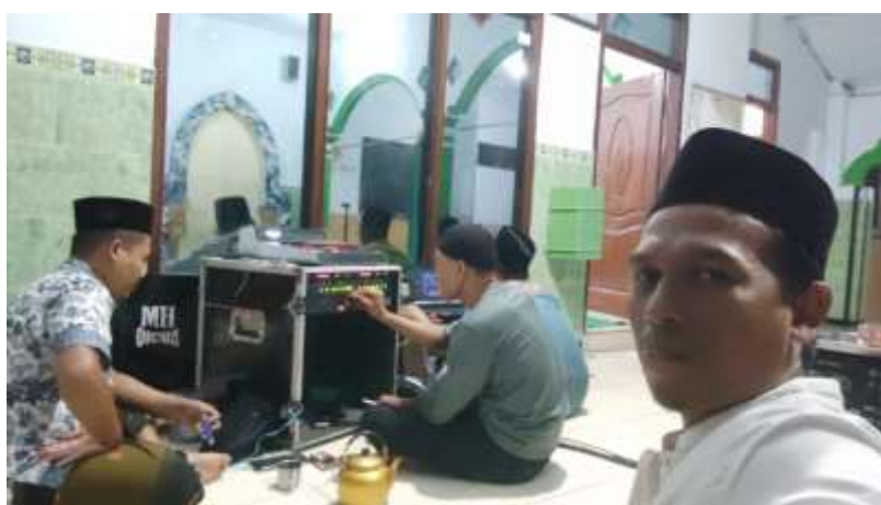
Figure 6. Sound Operator and Youtube media