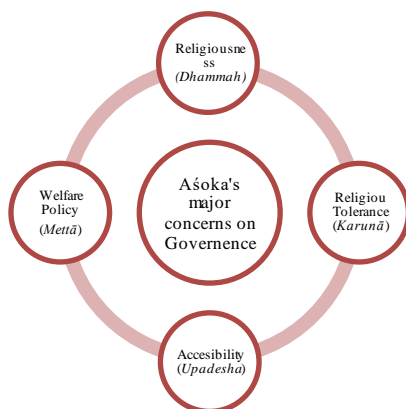
Figure: 1: Asoka's relationship with the government