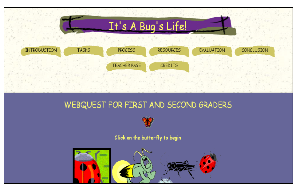
Picture 1.0 The home screen of a WebQuest entitled "It's A Bug's Life!"

Actually, teachers can also create or design their own WebQuest to make sure the materials fit the curriculum referred. However, it takes long and complex steps and process. It is easier to use WebQuest designed by the provider. The followings are the screenshots of a WebQuest with a title "It's A Bug Life". The WebQuest can be used by teachers to teach vocabulary with descriptive text and reading as approach. See below.