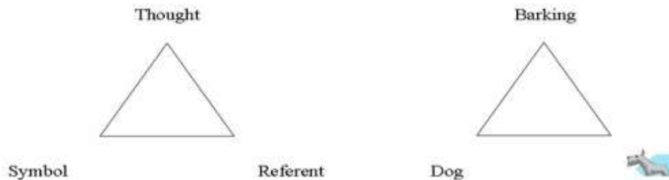
Figure 2.1 Semantic Triangle

One peak of the triangle would be the symbol “a word”. Another peak would be a thought, such as words to describe the symbol. Finally, the image we create in our minds would become the referent. Through the use of the Semantic Triangle, Ogden and Richards believe they have found a way to connect all words to their meaning. There are relationships between all three factors, represented by the sides of the triangle. The relationship between the thought and symbol are causal, meaning the symbol evokes an attitude or a proposed effect on another person. Similarly, there is a relationship between the thought and the referent, though the relationship can be either direct, such as something we can see in front of us, or indirect, such as an image or idea about something we have seen in another instance. Finally, the relationship between the symbol and the referent is purely indirect in that it is an arbitrary relationship created by someone who wishes the symbol to represent the referent. As demonstrated by the illustration above, the word “dog” is associated in the mind of the reader as a particular animal. The word is not the animal, but the association links the two, thus all three elements are required in an irreducible triad for the signs to operate correctly.