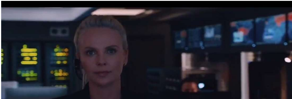
Figure 6 Chiper attacked the Russian headquarters

Soldier : “We have a possible threat incoming. Raise the barricade, As soon as possible. We’ve lost power, get to your positions now.”