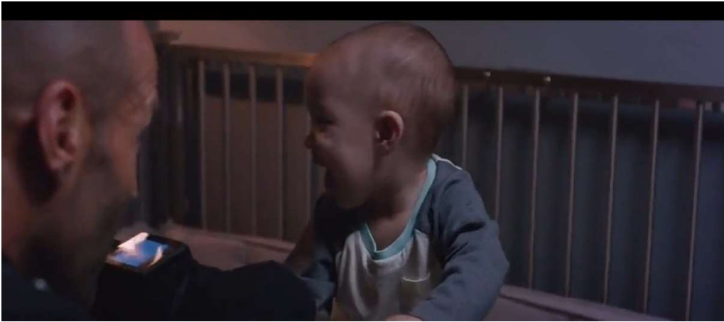
Figure 7 Deckard found dominic's son

Deckard : "I've got the package to lay on. Whole pounds of him."