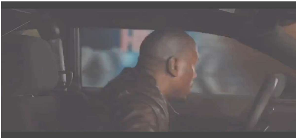
Figure 2 Hobbs and the team searched for EMP